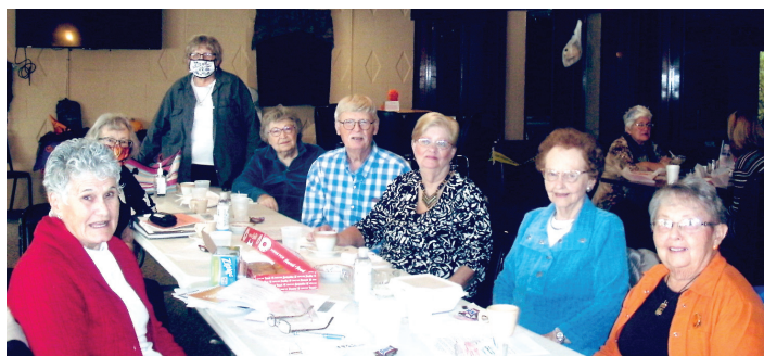
Our waitress kindly took our picture before we left.