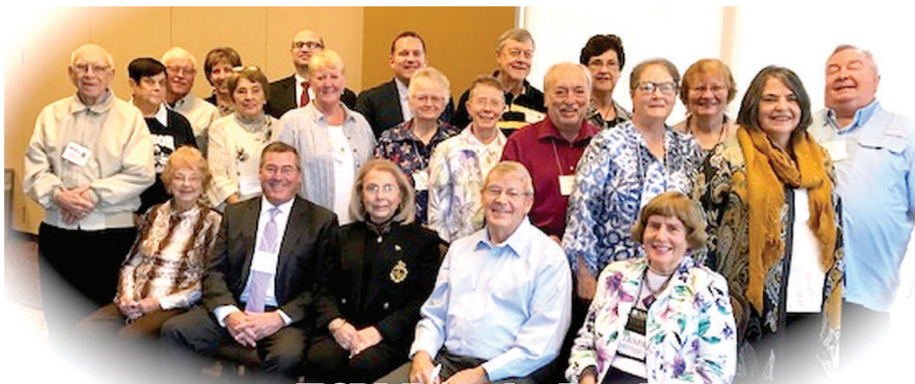
IRSPA Executive Board