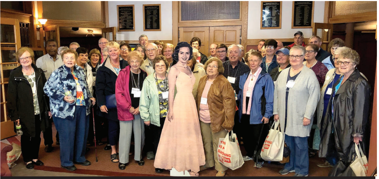
The tour of the Donna Reed Theatre and Museum was enjoyed by many of the IRSPA State convention participants. They enjoyed the "It's a Wonderful Life" experience by having a wonderful day.