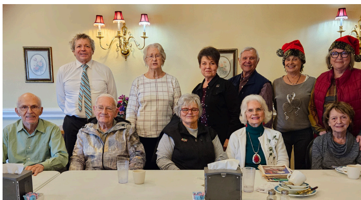
December 7th Pre Christmas picture