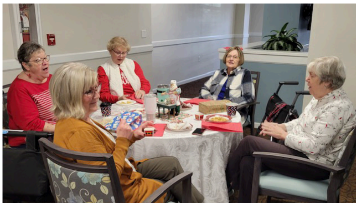
Games and prizes!

November program was about banned books and that generated much good discussion! In December we held our first 'Christmas Carols and Cookies' social. THAT was great fun, we had creative holiday themed games and prizes in addition to the cookie exchange and the singing! Coming up the end of Feb-