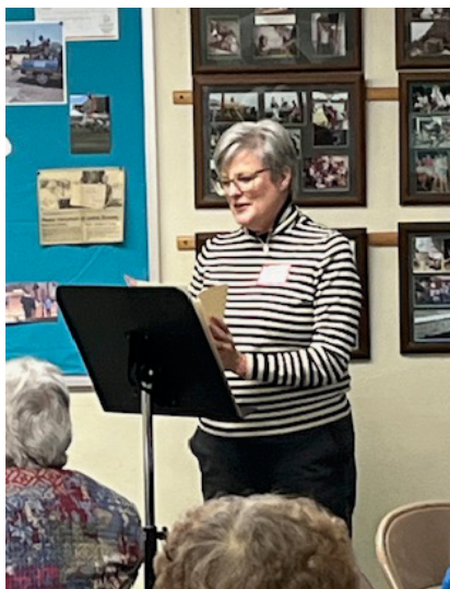
Librarian from Monroe, IA "The Real Conversation Around Banned Books"

When last we reported (Dec '23 issue) we said we were striving to meet our goal of 50 members present at our November meeting honoring our 50th anniversary of our existence. We tried and actually got several members who usually don't attend. We were thrilled... but we also had several members who usually DO come, but couldn't make it that day. (A repair man who didn't show up on time detained two of our usuals and sickness played a role too!) So, on balance... we were 6 short of our desired 50... close but alas not 50. Regardless, we continue to enjoy each other's company and our fabulous programs and food! As noted last time our