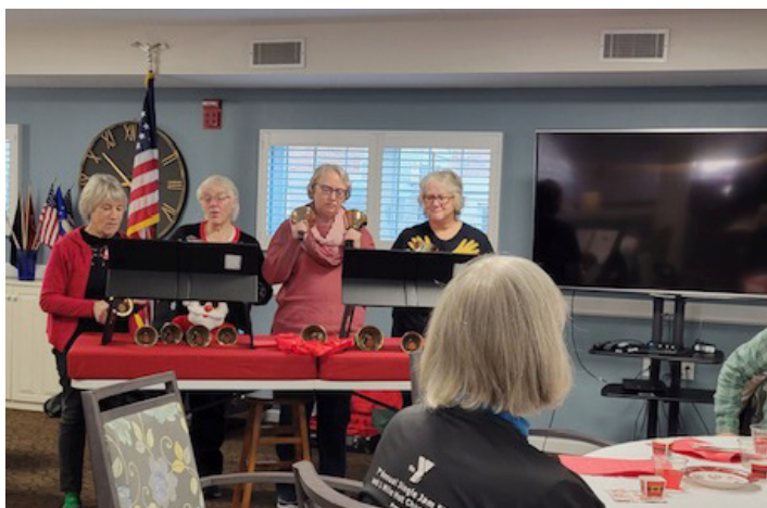
Christmas Bell Ringers and songs