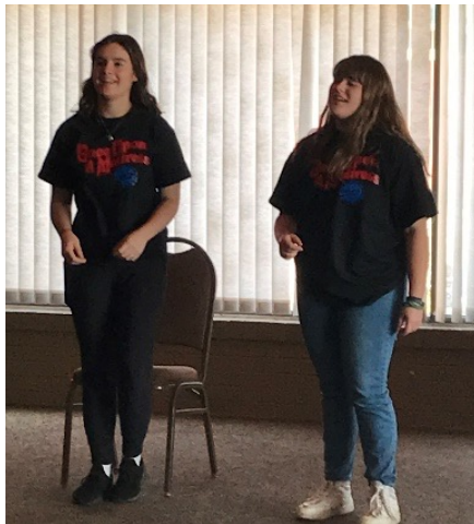
Students from Heartland Christian School

or any denominational group. It serves around 275 students from pre-k to 12th grade. They work with area school systems to provide additional opportunities for their students.