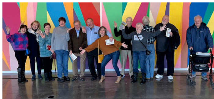
Art Museum Fun on a cold day