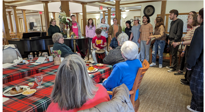
The music got really lively with a jazz version of "Oh Come All Ye Faithful."