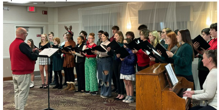
North High School Chamber Choir