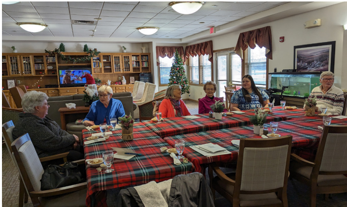
Jefferson County members visit before eating while waiting for others to arrive. Scotland, Wales, and Ireland.